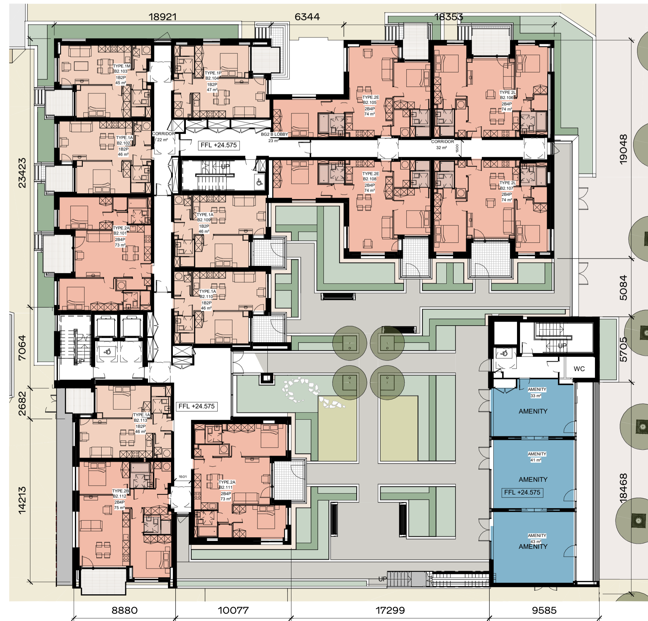
2 1200_BG2_BLOCKPLAN_L01_FFL 1 : 200

ALL DIMENSIONS TO BE CHECKED ON SITE NO DIMENSIONS TO BE SCALED FROM THIS DRAWING DRAWING IS TO BE READ IN CONJUNCTION WITH RELEVANT CONSULTANTS DRAWINGS