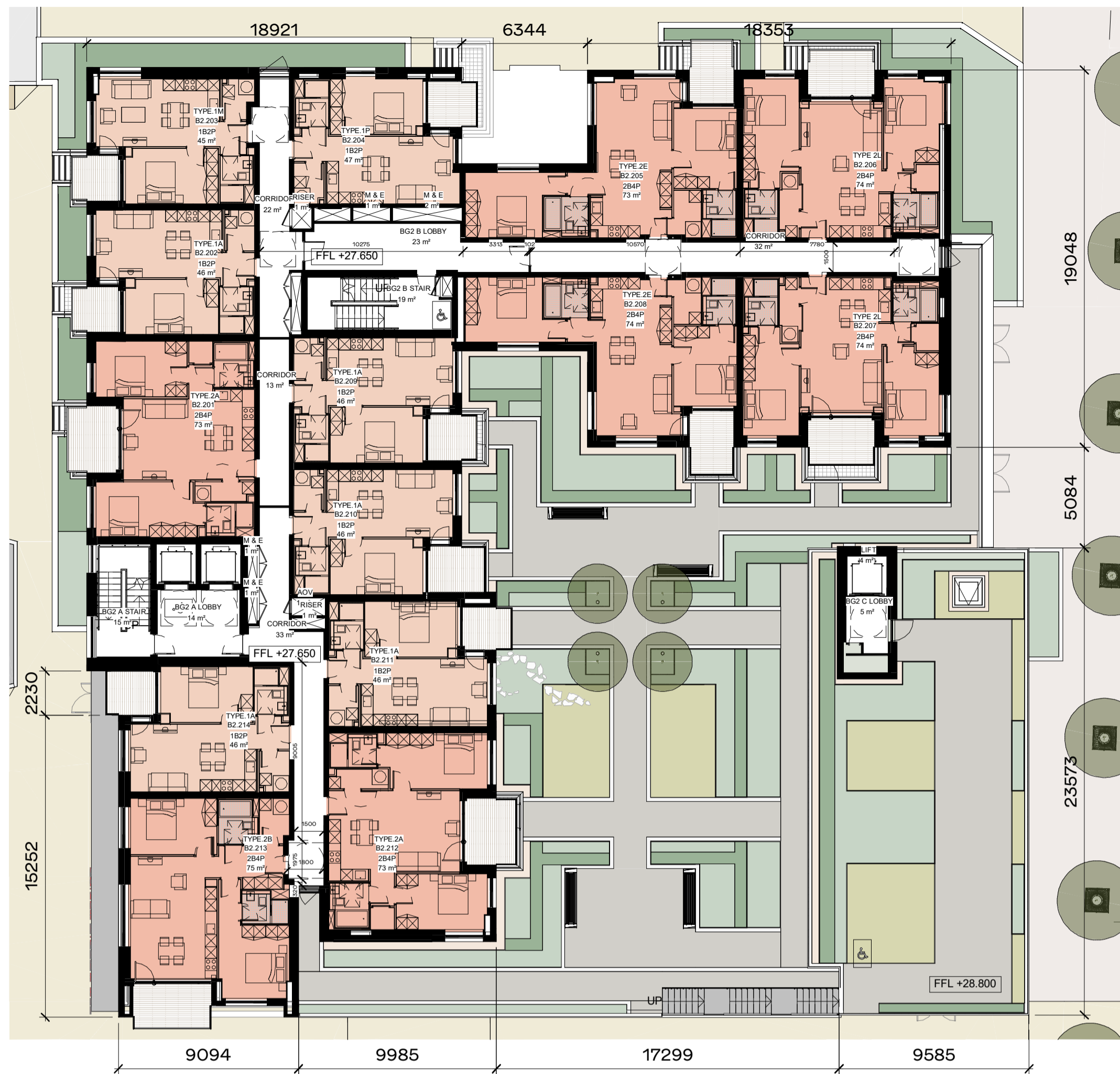
3 1200_BG2_BLOCKPLAN_L02_FFL 1 : 200