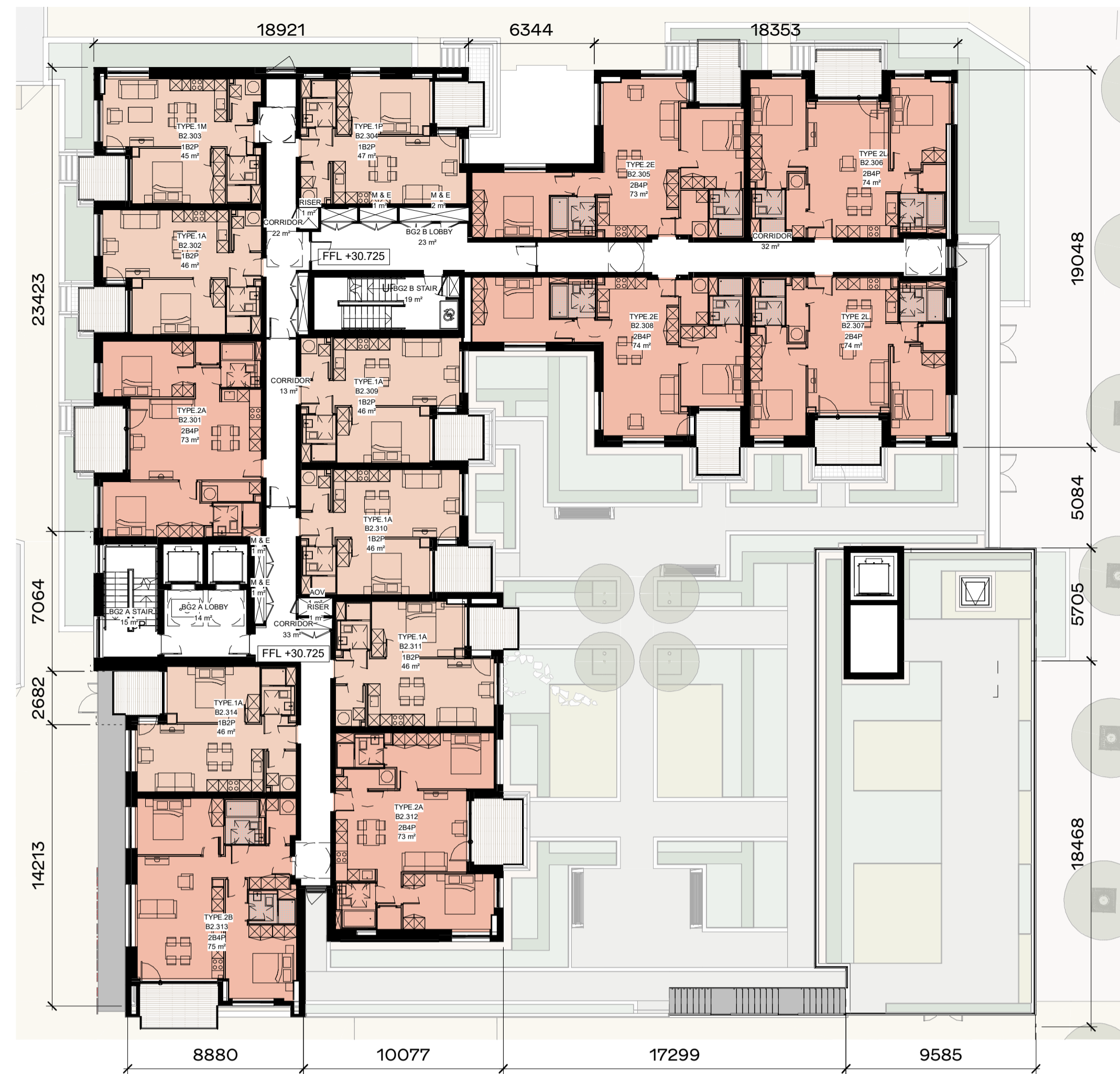
4 1200_BG2_BLOCKPLAN_L03_FFL 1 : 200