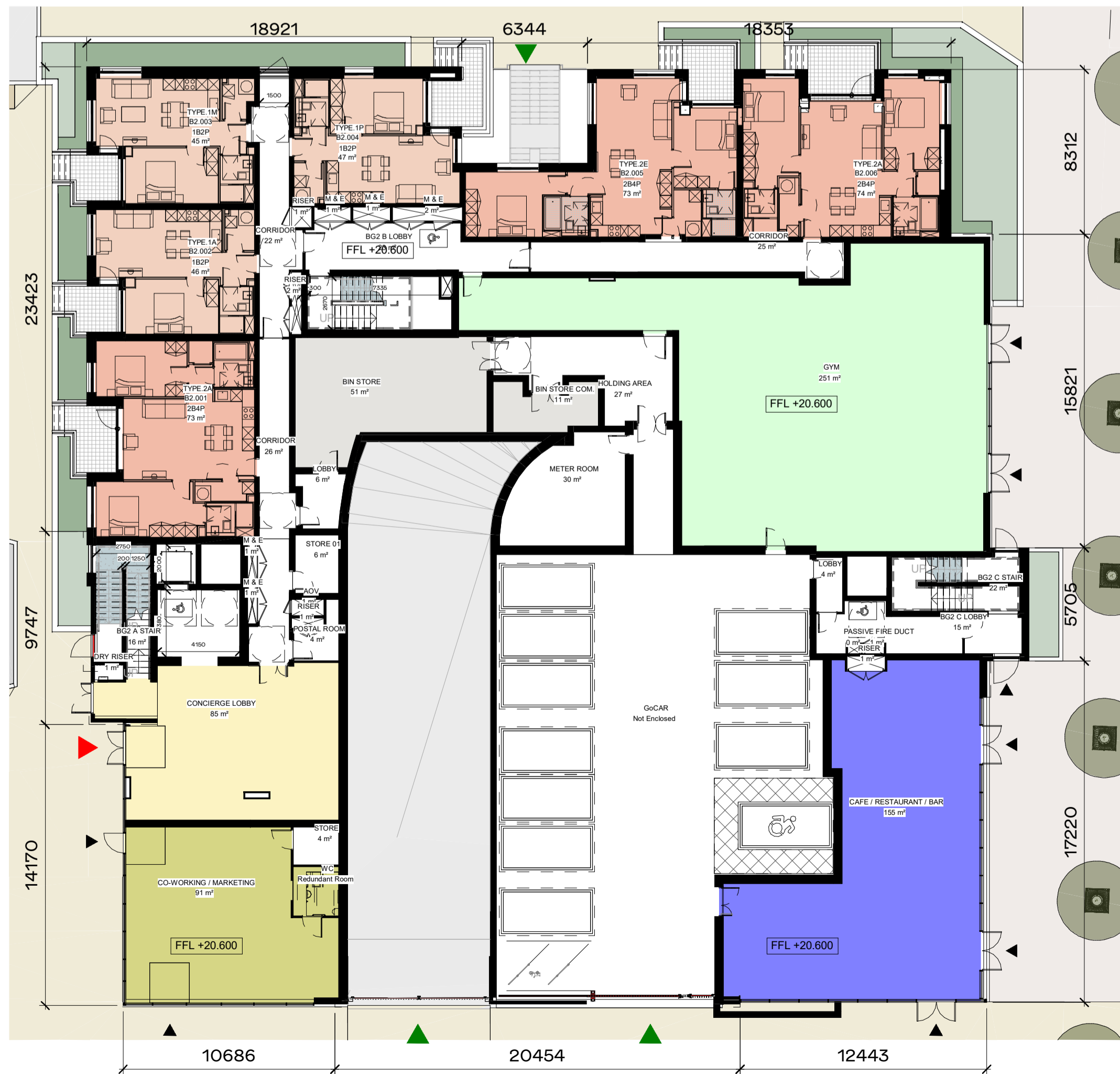
1 1200_BG2_BLOCKPLAN_L00_FFL 1 : 200